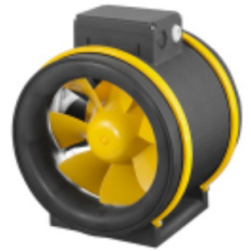
EM...M ETAMASTER tube fan with three speed steps