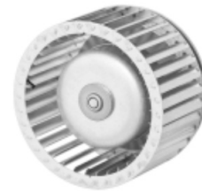
TE...EC Radial fan forward curved with EC motor