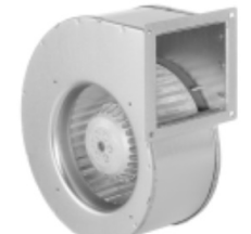
GE Single inlet, forward curved housing fan with AC motor