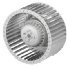
TE Radial fan forward curved with AC motor