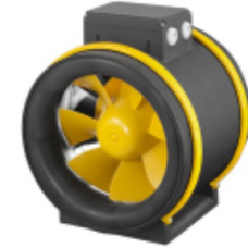
EM...EC ETAMASTER tube fan with EC motor