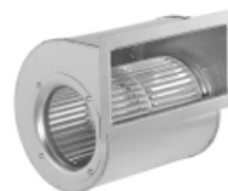
GD...EC Double inlet, forward curved housing fan with EC motor