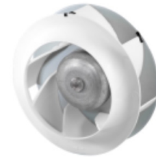
RE...EC Radial fan backward curved with EC motor