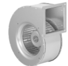
GE...EC Single inlet, forward curved housing fan with EC motor