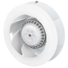
RE Radial fan backward curved with AC motor