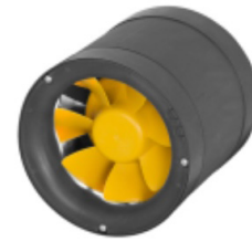
EM...E ETAMASTER tube fan with AC motor