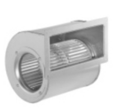
GD Double inlet, forward curved housing fan with AC motor